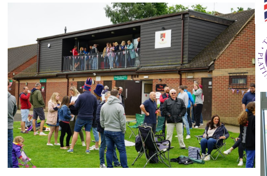
Thank you to all the volunteers, especially the Bredon WI, who served hot drinks and cakes.